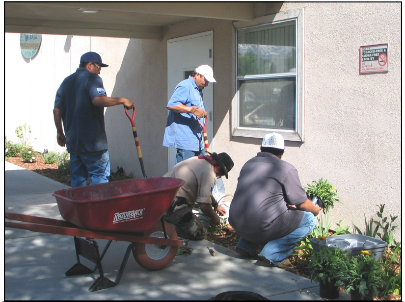
The Maintenance Crew Installing New Plants